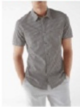
Short sleeve button down